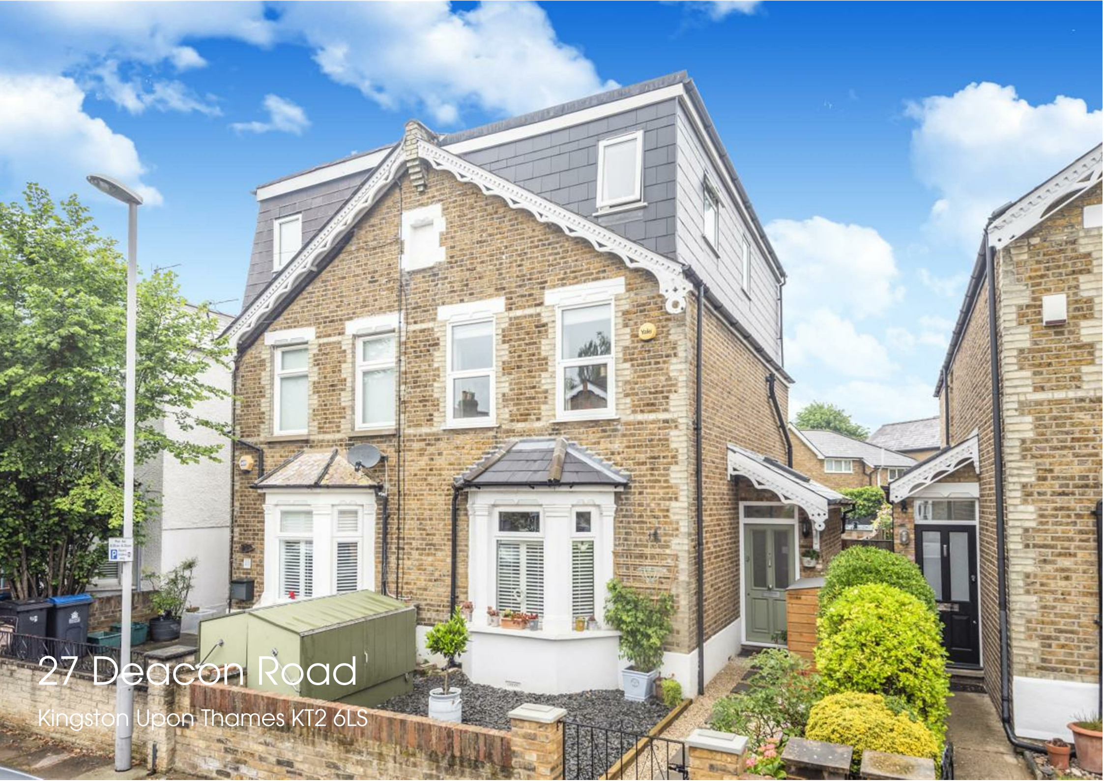
27 Deacon Road Kingston Upon Thames KT2 6LS

34 Richmond Road Kingston upon Thames Surrey KT2 5ED www.gibsonlane.co.uk Tel: 020 8546 5444